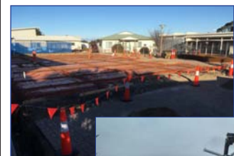
Kingscote Campus STEM building