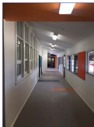
Parndana Campus STEM room upgrades