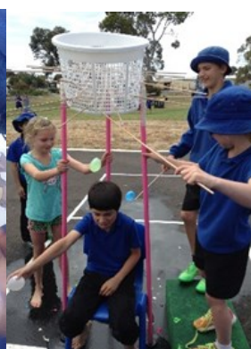
Below: Yr 6 & Reception students and their parents doing the "Titanic Challenge".