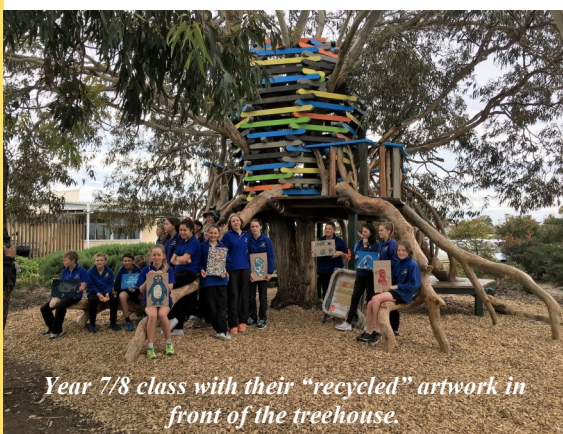
Year 7/8 class with their "recycled" artwork in front of the treehouse.